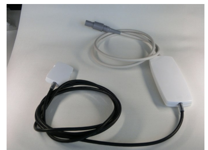
Figure 1: Sensor Belt Connector

Unlike traditional tomographic methods, Swisstom's imaging is driven by electrical impedance tomography (EIT). This technology will serve Swisstom as a platform for future product developments.