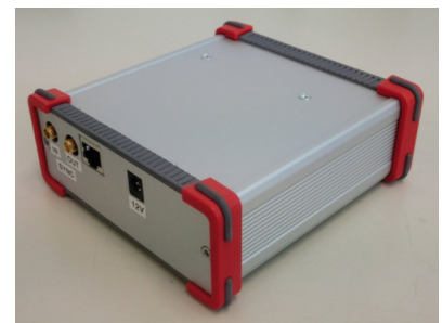
Figure 2: Interface module Module contains galvanic isolation for SensorBeltConnector and Ethernet connection to PC.

Unlike traditional tomographic methods, Swisstom’s imaging is driven by electrical impedance tomography (EIT). This technology will serve Swisstom as a platform for future product developments.