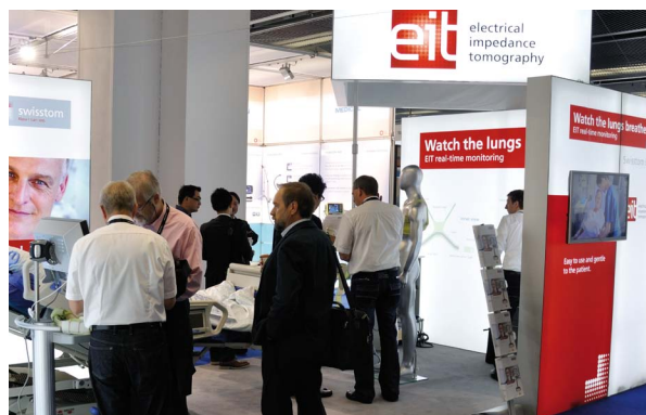
The Swisstom booth in Paris

Further detailed information, photos, videos and other materials can be retrieved from the download area at www.swisstom.com or will gladly be provided on request.