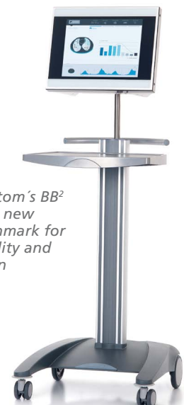
Swisstom’s BB² sets a new benchmark for usability and design

Phone +41 (0)81 330 09 72 Fax +41 (0)81 330 09 71 Mobile +41 (0)79 427 74 04 shb@swisstom.com www.swisstom.com